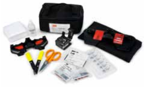
3M<sup>™</sup> Fibrlok<sup>™</sup> Splice Kit with Cleaver 2559-C