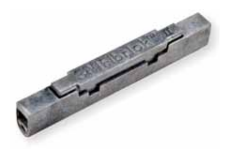
3M<sup>™</sup> Fibrlok<sup>™</sup> II Universal Optical Fiber Splice 2529