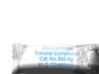
4 grams Pouch