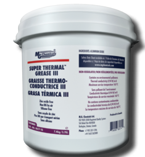
1 Gallon Pail