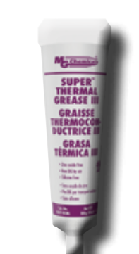
85 mL Tube