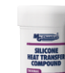
25 mL Jar