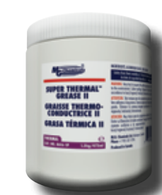
1 Pint Jar